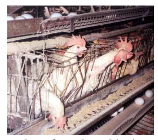
Battery Cage or Battery Prison?