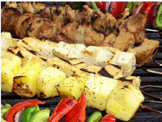
Tofu / seitan kabobs with spicy chipotle BBQ sauce from the pilot episode

Filming of the pilot episode wrapped up in early September, and a premiere party for the show will be held in late October or early November. Information about the premiere will be posted on www.rhymeswithvegan.com and the ARC website.