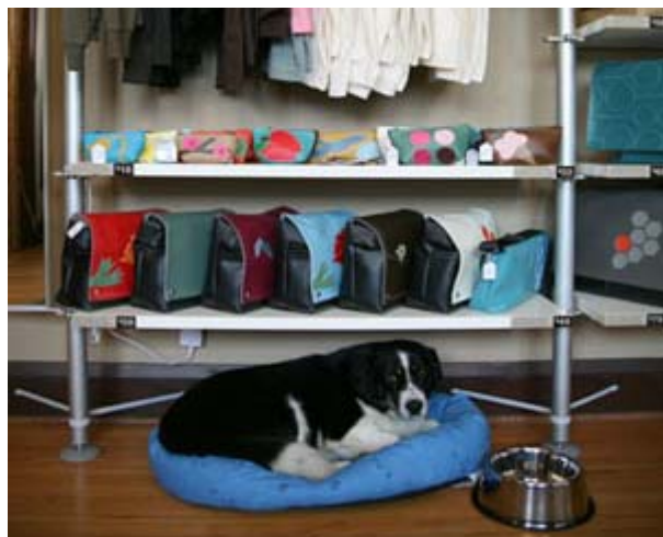
Thumper, who oversees the daily goings on at the storefront, is a little pooped from all the activity at the grand opening

In addition to all the great cruelty-free products for sale, the storefront features a reading area with comfy chairs and current animal rights literature and magazines, and a revolving gallery of work by local animal-friendly artists. We're excited to join the vibrant and diverse Seward neighborhood and we hope you'll come down and check us out.